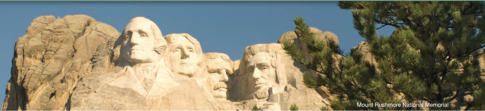
Mount Rushmore National Memorial