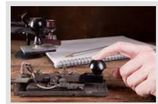
Figure out the message and answer the question inside this code

.. - .. ... - - - - - - - - - - - - - - - - - - - - . . . . . . . . . . - - - - - . . . . . - - - - - - - - - - .. . . . . - - - - - . . . . . . . . . . - - - - - . . . . . . . . . . . . . . . - . . . . . . . . . . - - - - - - - - - - - . . . . . . . . . .